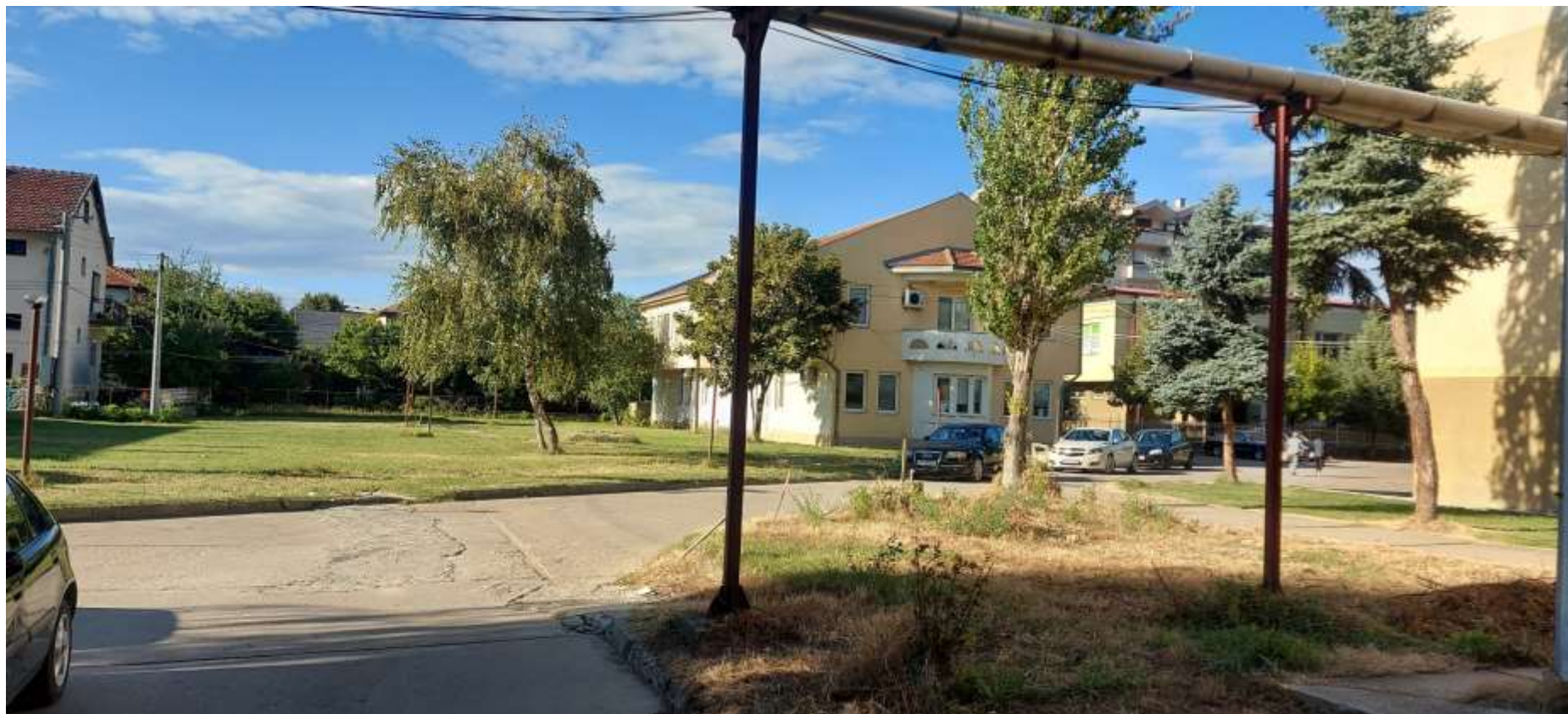
Figure 2 Pictures of the location where the mobile COVID 19 hospital will be installed