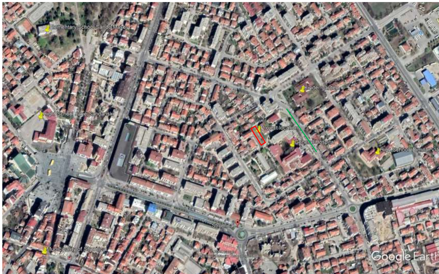
Figure 1 Micro location of the project area in Municipality of Strumica