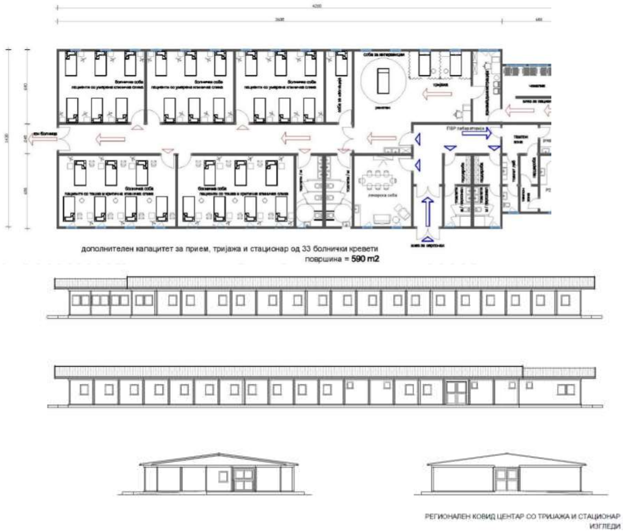
Figure 3 The look of the extended construction of the mobile hospital in Municipality of Strumica